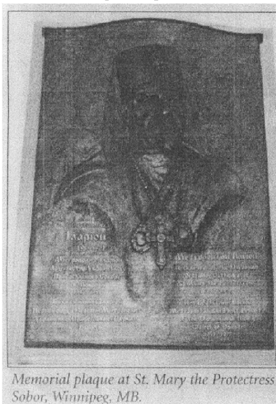
Memorial plaque at St. Mary the Protectress Sobor, Winnipeg, MB.

For further inquiries, please call the Editorial Office or email visnyk@uoc.uu