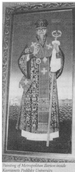
Painting of Metropolitan Ilarion inside Kamianets Podilsky University.